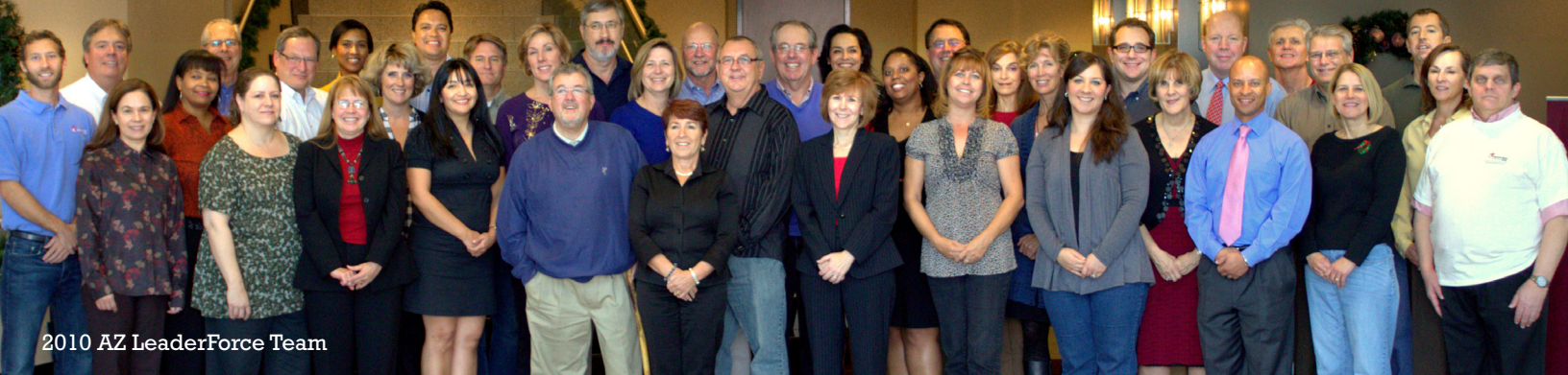
2010 AZ LeaderForce Team